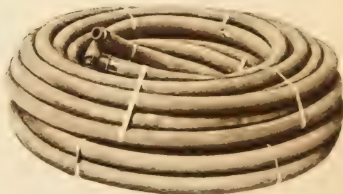
Henderson's "Best Para" Rubber Hose

This is the highest grade of garden hose, being made entirely from New Para Rubber, and will outlast cheap hose three times over. We guarantee it to stand a 300-lb. water pressure, and it will be as resilient in three or four years' time as when new while cheap hose of that age will be hard and rotten. Every length of Henderson "Best Para" Hose is fitted with the new water-tight couplings, without extra charge. (See engraving.) (Hose is furnished only in 25-foot and 50-foot length; the sizes ¾ and 1 inch refer to the internal diameter of the bore.)